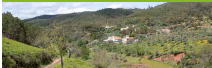
Surrounding of Pinheiro village