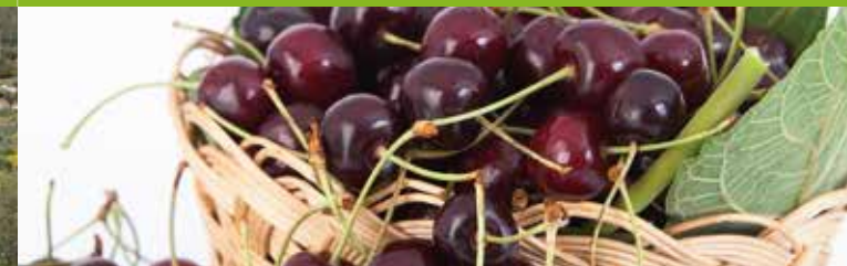
Cherry from São Julião (Designation of Protected Origin)