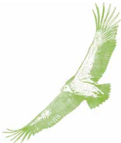
Griffon vulture ( Gyps fulvus ). Always patrolling the fields monitoring health.

This path runs along two distinct valleys. First, we climb up by the valley of Barranco da Caleira and then, we descend through the valley of the Ribeira de Arronches. Along both pathways there are numerous small farms dedicated to subsistence agriculture, which for centuries has been modelling the slopes of the mountain, with terraces that allowed the cultivation on these steep slopes and at the same time also maintaining an important pastoral activity. However, some of these small farms and lands are already abandoned, leading to the recent pine and eucalyptus plantations. But in the valley of the Ribeira de Arronches we still find some agricultural activity, mainly linked to cereal cultivation, small groves of chestnut trees ( soutos ), some traditional olive groves and pastures with goats or sheep. The path also passes along the east ridge of Ribeira de Arronches, where the view, despite the altitude, is blocked by nearby mountains, both Portuguese and Spanish. Here and there the landscape is interrupted by quartzite outcroppings. The summit of the Serra de São Mamede is within easy reach. We go down the valley until we have the chance to cross it in a leafy riverside gallery area. We keep walking past more farms and then we return to the starting point of this path.