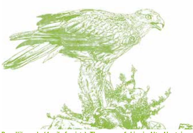
Bonelli's eagle (Aquila fasciata). The queen of skies in Alto Alentejo.

This path takes us through the surrounding area of Portalegre, along its north-eastern highest points, sometimes with panoramic city views from which we can identify some of its most emblematic buildings, other times by ancient narrow stone-paved roadways, passing numerous properties and small villages. This is very green pathway, with numerous groves of Pyrenean oak, chestnut trees, cork oak and pine that are home to other flora and fauna. The abundance of mosses and lichens covering the walls and tree trunks are not only an indication of the cool atmosphere of the place, but its air quality as well. In its more eastern section we have marvellous views of the Serra de São Mamede. Towards the end we go down by Estrada do Boletim Meteorológico and we pass along the Meteorological Station of Portalegre. Just below, the old watchtower called Atalaião arises. Returning to Estrada da Serra, we can still relax and enjoy another view of the city from either the Fountain of Amores, or from the viewpoint located a few meters ahead.