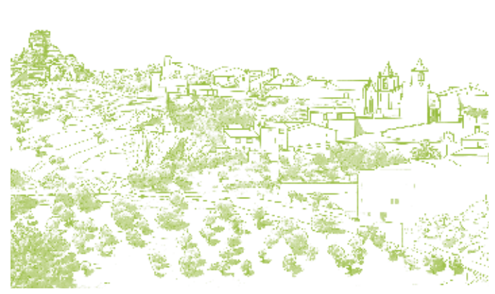
Castle of Alegrete. Although with the ruined tower, the castle is an excellent viewpoint.

This circular walking path starts and ends next to the Nova Fountain, a pleasant riverside recreation area in Alegrete, and offers a variety of settings. It runs through part of one of the most humanized Nature Parks of the country, which here has a landscape strongly influenced by human activities. It is precisely this characteristic that we see along the way: a mixed forest of maritime pine and eucalyptus, montados , olive groves, vineyards and vegetable gardens. The rockrose fields are also present, as well as some viewing angles from the highest points of the mountain, where the Pico de São Mamede is located. One of the most refreshing sections of the path follows the banks of Ribeira Arronches, which flows along in the shade of alders, willows, sanguinhos and cherry trees. The points of interest remind us of long-abandoned farming practices: threshing-floors, apiary walls, dams and levadas . The diversity of agro-systems is complemented by the diversity of habitats.