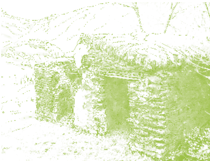
Watermill of Moinho Branco. On the banks of the Sever River, an ideal place to eat lunch and rest.

The walking path begins in Montalvão, a rural village situated high on a hill from which you can see the landscapes of Alentejo, Beira and Spain. We suggest a visit to the old town, castle, parish church and the community oven. The path follows the road of Montalvão - Póvoa, leaving the village and turning on the first pathway on the left to the steep slopes of the Sever River. Travelling paths once used by farmers and smugglers, you pass by the Fountain of Pales, the Tapada da Queijeira and at the Alto da Pobreza there is a good lookout point over the mouth of the Ribeira de São João. You then come to the mill of Moinho Branco, an area of steep slopes carved by watercourses, ideal for sport fishing. Follow the bank of the Sever River, with Spain always the other side, in an area of dense vegetation where fountains and springs abound, with some traditional buildings and shelters in schist, now used by fishermen. Below, the path leaves the river, reaching the pontoon of Ribeiro do Lapão, built in schist over a polished stone bed. Located close by, surrounded by olive trees in terraces, is the Abrigo do Pescador (fisherman's shelter). On the way back to Montalvão, the climb follows footpaths that pass by the threshing-floor of Ferreira.